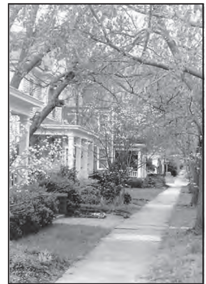
The guidelines address not only buildings, but the street context within which they are located.

The Raleigh Historic Development Commission serves as the City Council's official historic preservation advisory body to identify, preserve, protect, and promote Raleigh's historic resources.