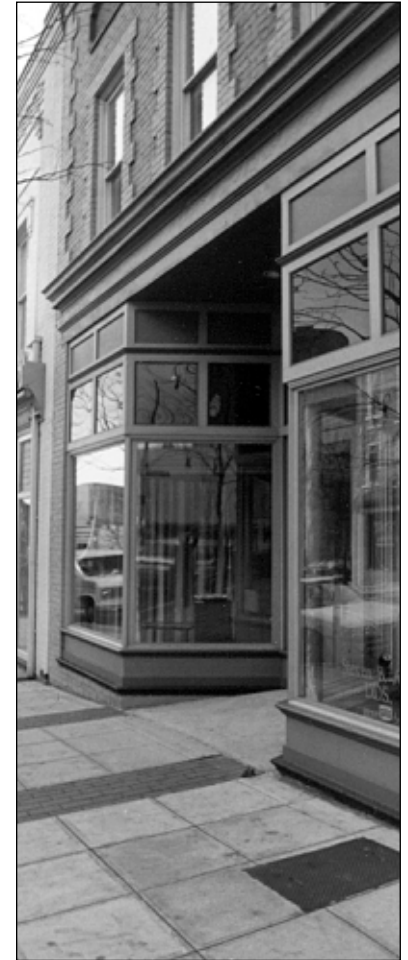
This replacement storefront design is compatible with the building in its scale, size, materials, and colors.