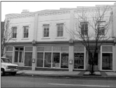
The storefront bays with their decorative mid-cornices and bands of glazed transom panels contribute to the architectural character of this Hargett Street commercial building.