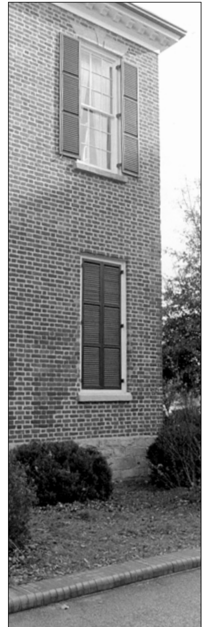
Louvered blinds provide a traditional means of shading the sun's heat from the interior of a structure while allowing ventilation.