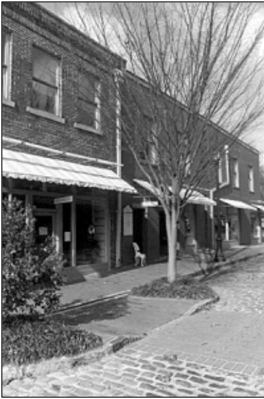
A unifying facade rhythm is created by the pattern of recessed entries, display windows, and projecting awnings of these sensitively rehabilitated storefronts.

Most historic commercial buildings in downtown Raleigh are two to four stories in height, and their street facades are vertical in proportion. Typically, storefront display windows rest on low wooden recessed panels or on bulkheads constructed of masonry or faced in ceramic tile. Some storefronts use recessed entries to draw the pedestrian into the store and maximize the display window area. In the Moore Square district, street-level storefronts punctuate the brick facades and create a streetscape rhythm of inset openings and projecting awnings. Glazed transoms provide opportunities to pull diffused daylight deep into the building.