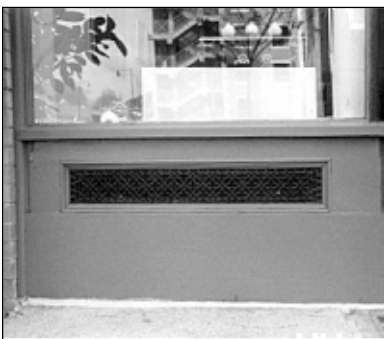
The cast-iron grille recessed within this storefront bulkhead panel is both decorative and functional.