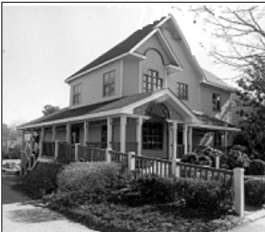
Both the use of traditional materials and details and the addition of landscape screening successfully integrate this ramp with the building and its site.