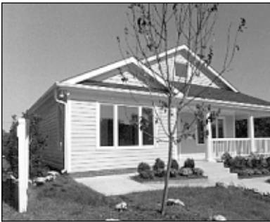
A universal design residence in the Oakwood district provides access to the front porch both by steps and by ramp.