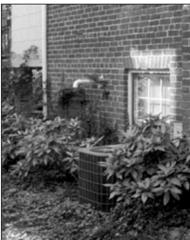
This mechanical unit was installed on a rear side facade and further screened from view by foundation plantings.