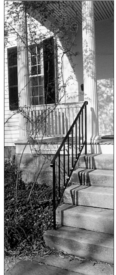
This discrete black handrail provides a safe edge for a steep entry stair.