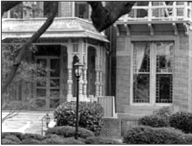
A mechanical lift provides access to the entrance of the Executive Mansion from the right side of the front porch. The lift itself is partially screened by the foundation plantings.

Because of the characteristic raised foundation of many early Raleigh buildings, accessibility for persons with disabilities often requires the introduction of a ramp or a lift to the first-floor level. Safety codes may also dictate additional exits and/or a fire stair. The introduction of railings, handrails, or other safety features may be needed as well. Complying with such requirements in ways that are sensitive to the historic character of the building and the site demands creative design solutions developed with input from local code officials, representatives of local disability groups, and historic preservation specialists. Whether the modifications are large or small, however, with respect to the long-term preservation of the historic building, temporary or reversible alternatives are preferable to permanent or irreversible ones.