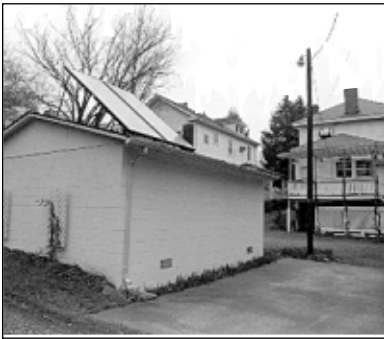
These solar collector panels are inconspicuously located on the roof of an accessory building at the rear of the property.