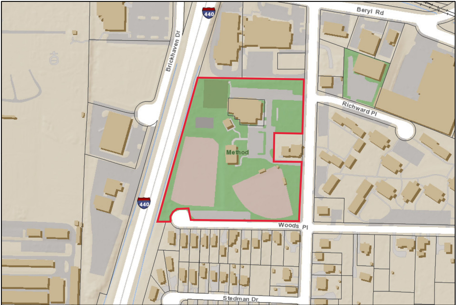
Berry O'Kelly School Landmark Boundary